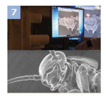
After evacuation, start observation immediately. (NanoSuit (barrier layer) is formed by electron beam irradiation.)